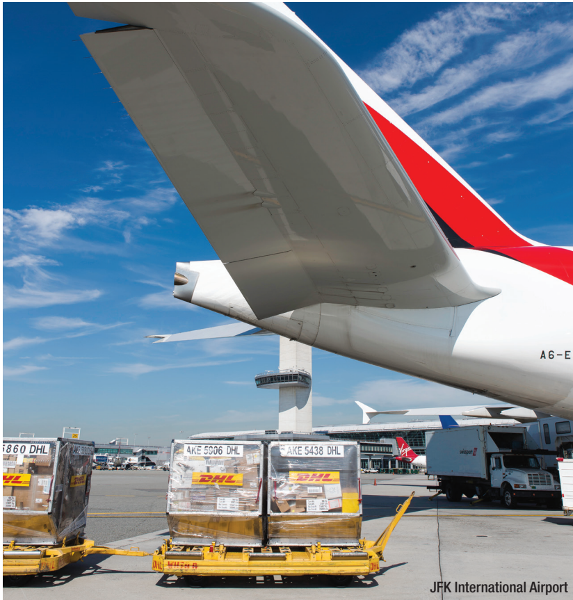
JFK International Airport